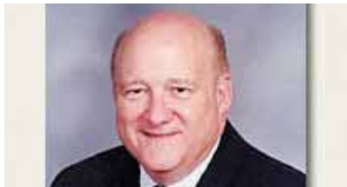
Wilderness Way ... 4A