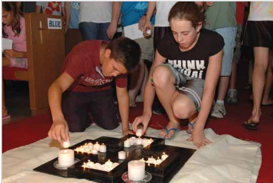
ABOVE: Opening worship at the Breckenridge UMC living center revolved around a cross the youth had made. Each individual participant lighted a candle and by the end of worship they had melded together to complete the cross. AT RIGHT: Junior high school students get practical experience in proper power tool usage and how to level their work while serving God and community through life-changing missions.

CTCYM is funded by the fees paid by participants to attend and by donations from other mission-minded individuals. In September, CTCYM will introduce CTCYM: Beyond Our Borders, a fund-raising project for local youth groups to help bring clean drinking water to people in Liberia.