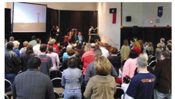
Advancing the Kingdom ... 8A