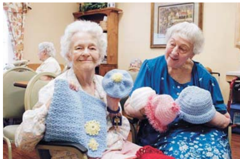
Serving where you are ... 5A