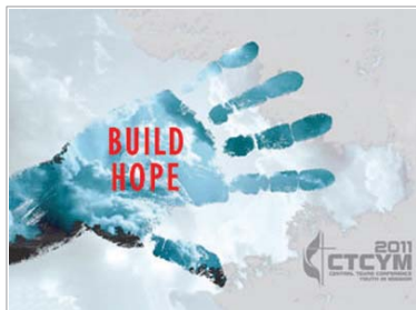
CTCYM Leader Training ... 8A