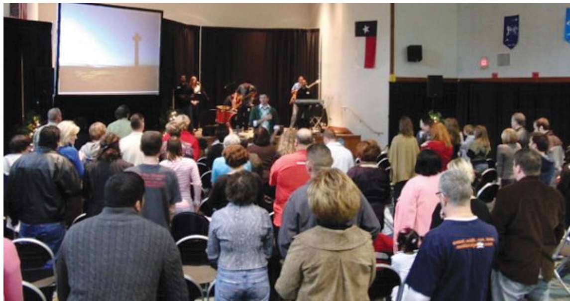
Rockbridge Church in Round Rock, with over 100 in weekly worship, will be moving to a new facility.

This fall, St. James United Methodist Church in Temple began parenting a new African American community of faith in