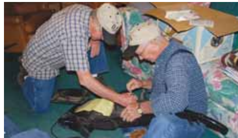
Good neighbors ... 5A