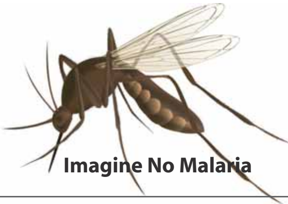
Imagine No Malaria