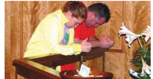
Jump start on INM ... 5A