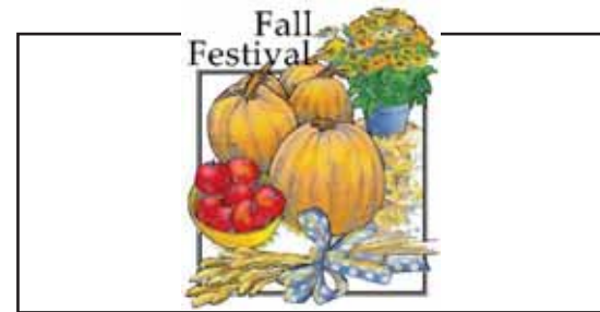
Fall fund raisers ... next issue