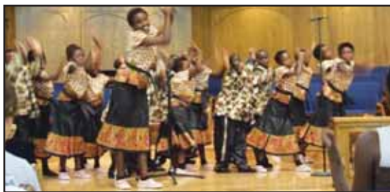
HACC back in Texas ... 5A