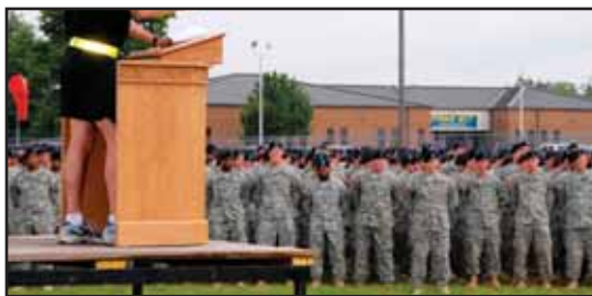
Suicide prevention ... 5A