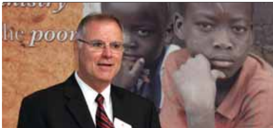
RETHINK Church ... 4A