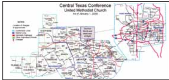
Finally! New CTC map ... 8A