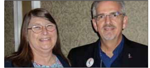
Congress on Evangelism ... 8A