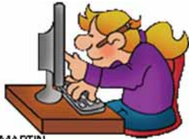
MARTIN Centennial logo ... 5A