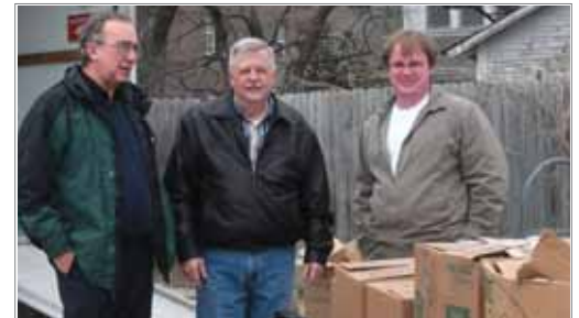
More on Haiti response ... 8A