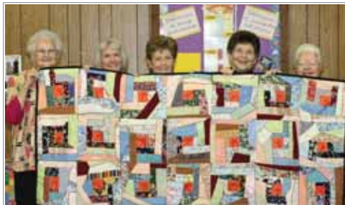
Today's quilters ... 5A