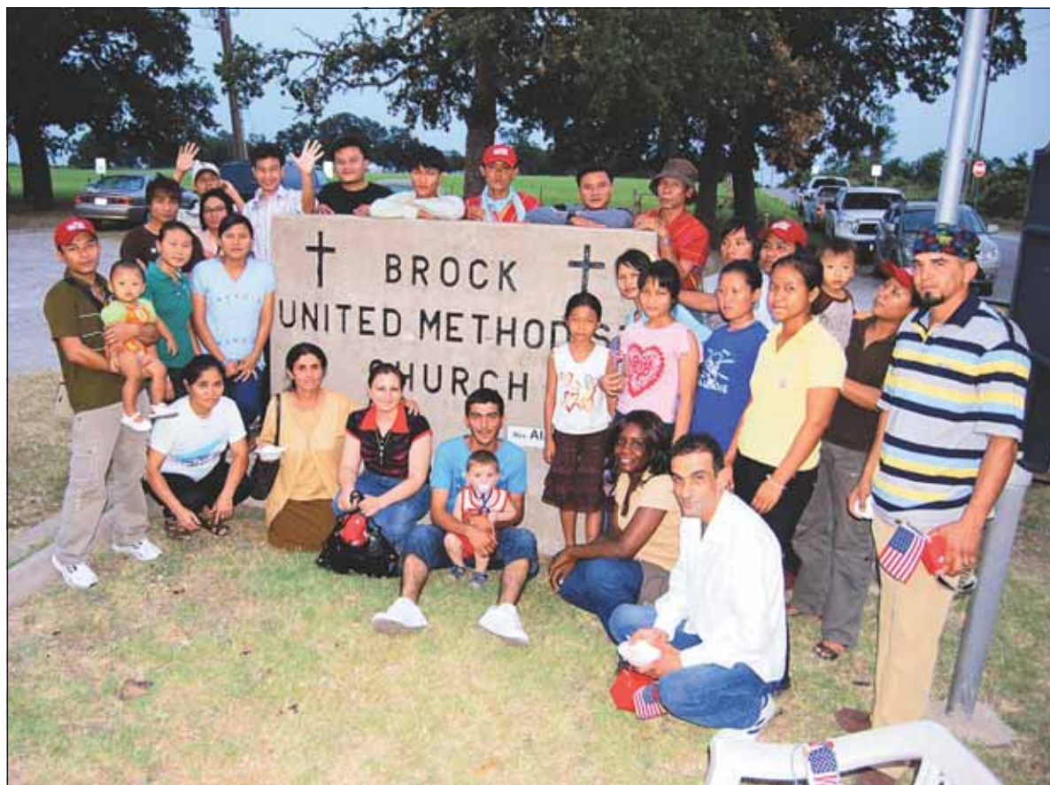
Members of Brock United Methodist Church, just west of Weatherford, hosted about 50 Iraqi and Burmese refugees as a part of America's our Fourth of July observance and another step in the refugees' cultural exposure to their new nation home.