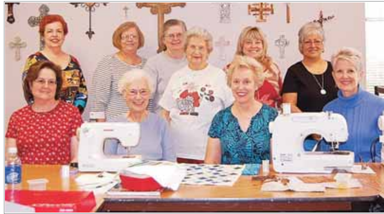
Peacemaker Quilters (above) prepare for their Lord's Acre quilt making, and (below) sew comfort pillows for military troops being deployed.

One project we may be called to work on is constructing a quilt for our Sunday School Department after the children create their own drawings on blocks of muslin.