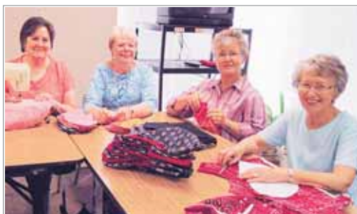
Peacemaker Quilters ... 5A