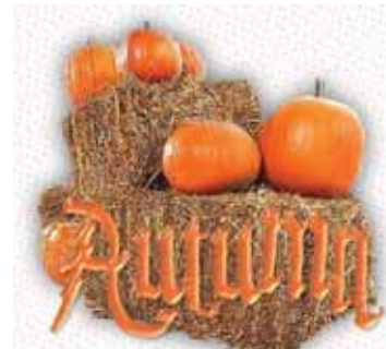
Fall fundraiser listing ... 8A