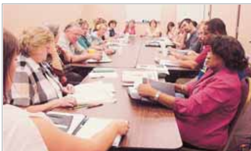
Adult Disciples ... 5A