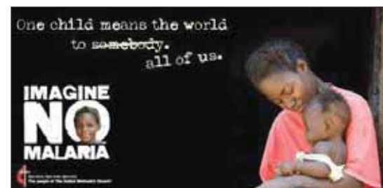
INM Partytime ... 8A