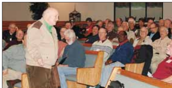
Men's Gathering ... 5A