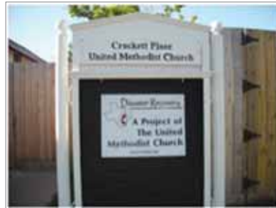
Volunteers from First United Methodist Church of Burleson responded to UMCOR's call to help restore homes and churches in the hurricane damaged areas of Galveston. More volunteers are needed.