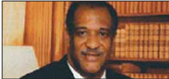
Preaching Eloquence ... 5A