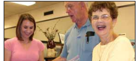
Birthing Kits ... 5A