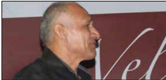
Newgate Awards ... 5A