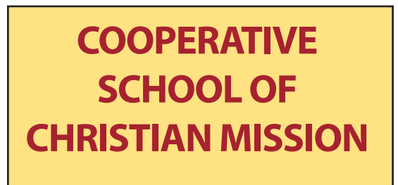
Together at the Table ... 8A