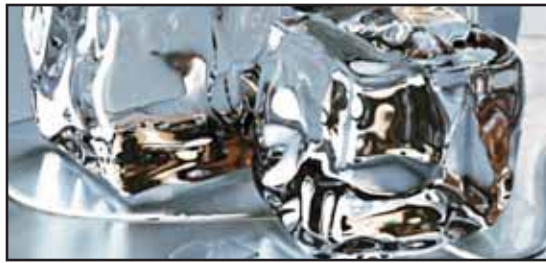
Ice Maker Needed! ... 8A