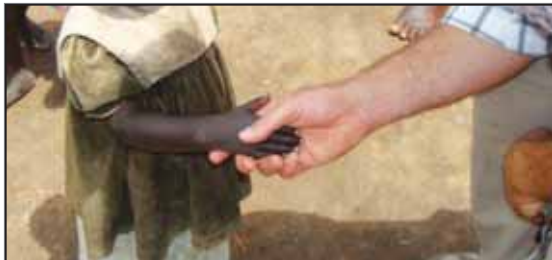
Connecting in Uganda ... 8A

Official Publication for the Central Texas Conference