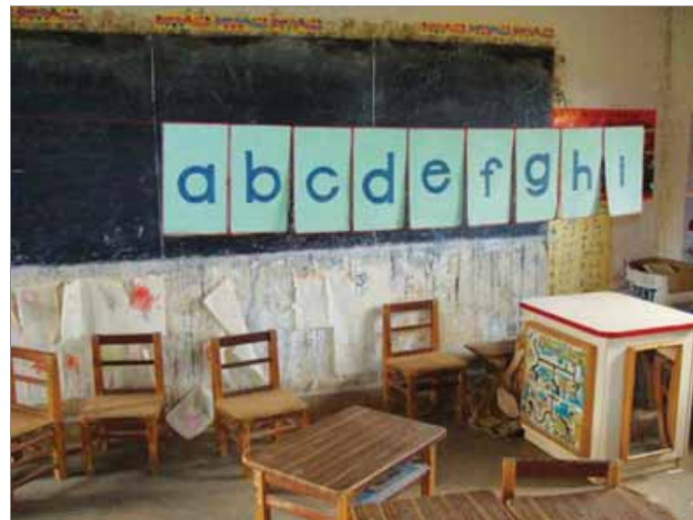
Humble School offers a brighter future for the orphaned children of Uganda — something volunteers can help to support.

2009 for anyone interested in going to Uganda. We are still in the planning stage of the trip. We would like to include some teachers, some medical professionals (doctors and dentists) and some people with willing hands to help with general maintenance. Of course, the most important thing that