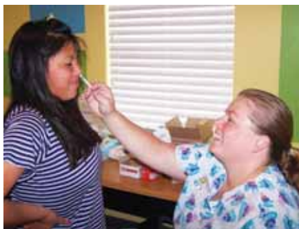
Above, a nurse from Harris Methodist Hospital administers free flu shots, even to youngsters who may be a little hesitant. At left, a nurse from Cook Children's Hospital offers the nasal flu vaccine to a more willing youth.