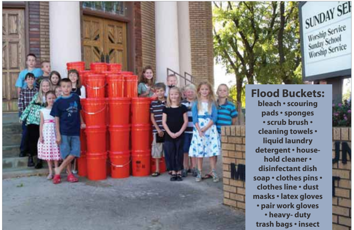
Assembling 60 flood buckets involved even the children at First United Methodist Church of Stephenville.