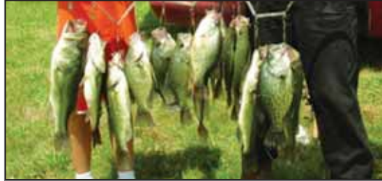
A great fish tale ... 8A