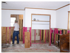
Removing drywall and insulation from a flooded home after Hurricane Ike

Early Response Teams —The mission of an Early Response Team (ERT) is to provide a caring Christian presence in the aftermath of a disaster, under very specific guidelines that enable a team to be productive and caring while causing no further harm or being a burden to the affected