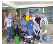
Worshipping with a family after Hurricane Ike

community. Early Response Teams respond after emergency personnel to disasters such as fires, hurricanes, tornadoes, and flooding to help families with clean-up, prevention of more damage to homes, and clean out of homes. A one day training must be completed to participate in this type of response. Classes are taught by authorized UMCOR trainers from our conference, and team members are given ID badges as evidence of training.