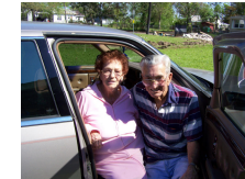
A couple from Orange, Texas wait for work to be finished on their home after Hurricane Ike

Disaster Response Organized by Your Local Church —Your church has the opportunity to open its doors in a time of disaster by setting up a shelter, providing meals, serving as a relief supply distribution center, or addressing other community needs. For more information and ideas, please visit www.ctcumc.org/disaster . Contact your local Red Cross chapter to become an approved shelter site. The conference also offers a Connecting Neighbors training geared toward guiding local churches in preparing for and responding to disasters in their own communities and beyond.