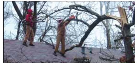
Ice damage at SCJ center ... 8A