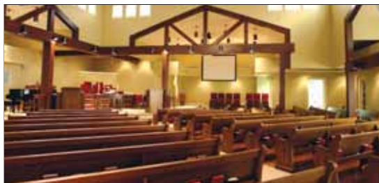
New look at Glen Rose ... 5A