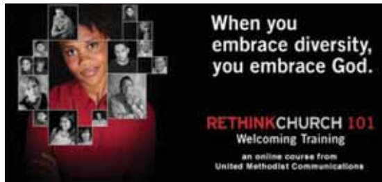
RETHINK Church ... 5A

Official Publication for the Central Texas Conference