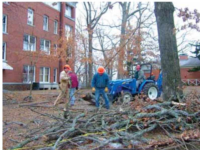
Storms on Jan. 27 left an accumulation of two inches of ice that damaged nearly all the trees at Mount Sequoyah, the South Central Jurisdictional Retreat Center in Fayetteville, Ark.

assist the staff of Mount Sequoyah as they work to restore full operations.